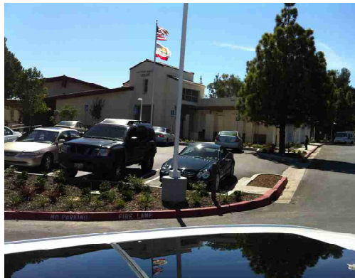
Laguna Niguel Library