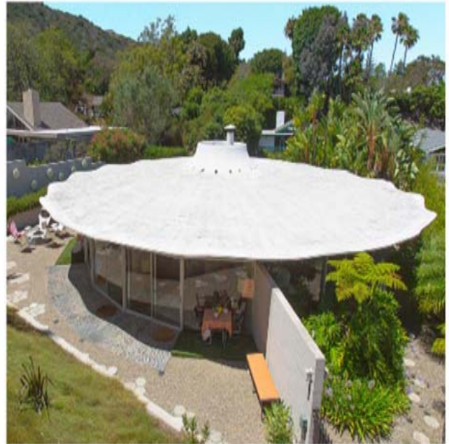
The Horizon House was the first home that went up in the master-planned community.

It was a startling sight for a private pilot buzzing over the Southland Coast in the spring of 1964. A flying saucer had touched down in the rugged hills of the old Rancho Niguel, a sheep ranch just a mile from the Pacific.