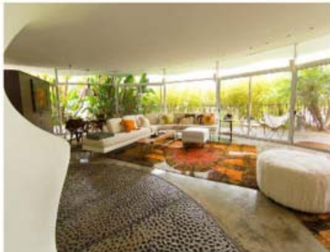
Horizon living room.