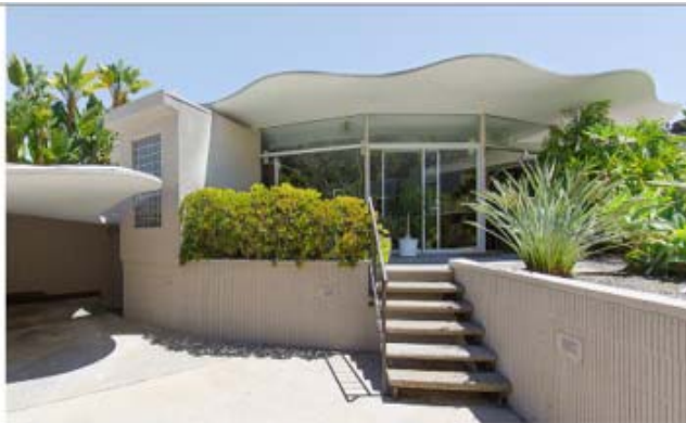
At the entrance to the Horizon House: a spectacular bit of architectural sculpture.