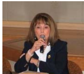
Hon. Pat Bates